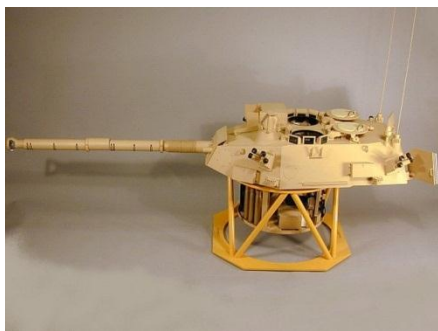
1:4 Scale LCTS 90mm Turret

Models with internal detail are often used to create more interest in a simple external detail model. Internal components can be modelled on actual equipment, or, in case of security issues, generic equipment. Internal detail can be built into models at almost any scale from full sized to 1:50 scale.