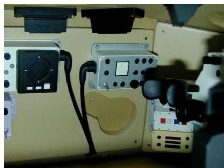
1:4 Scale LCTS 90mm Turret: Commander Station