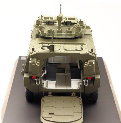
Opposite: 1:10 scale LAV model with full internal detail including turret