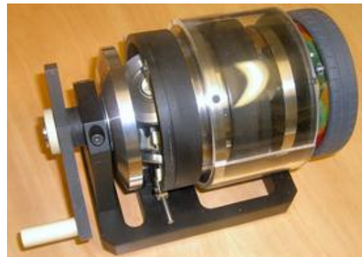
Half scale working model of a Torodial Variable transmission