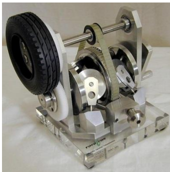
Early prototype of a Torodial Variable transmission