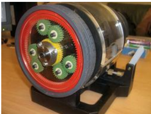
Half scale working model of a Torodial Variable transmission

With a team of experienced engineering modelmakers, Lawson's can undertake any type of engineering and mechanical modelmaking. From static prototypes to working models, we can handle it.