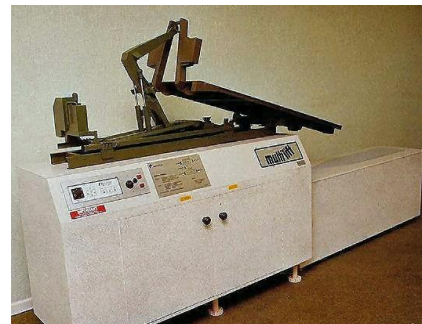
Working model of DROPS