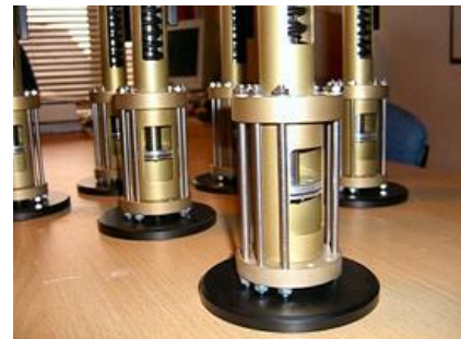
Sales demonstrator valve models